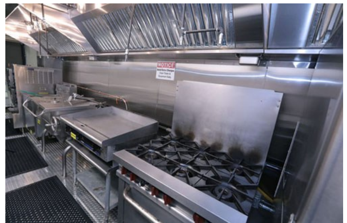
Exterior and interior images of proposed mobile self-contained kitchen trailer unit.