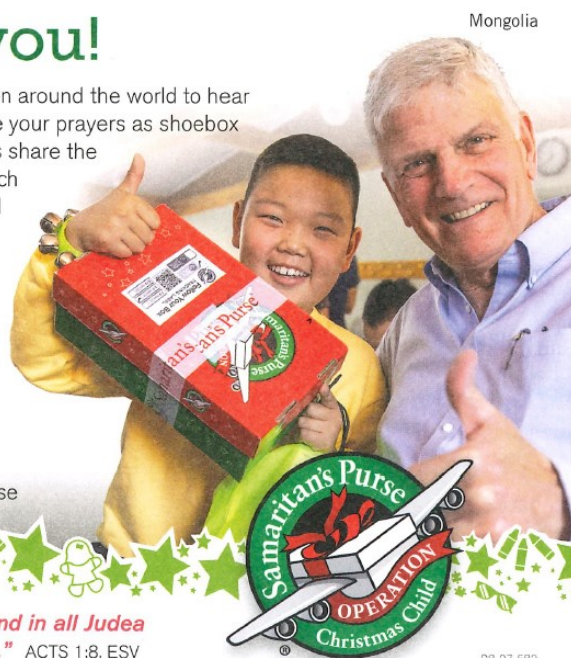
Franklin Graham | President, Samaritan's Purse

"You will be my witnesses in Jerusalem and in all Judea and Samaria, and to the end of the earth." ACTS 1:8, ESV