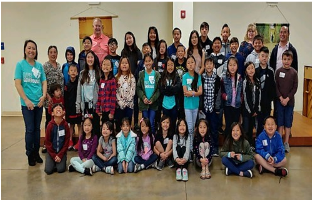
Fresno Hmong Language School Spring 2019 Group Picture.

The Hmong people came to the United States as refugees following the Vietnam war. After living in the US for over forty years, the children and young adults are losing Hmong language skills which are important to their elders. The Hmong Language School teaches language skills using Hmong